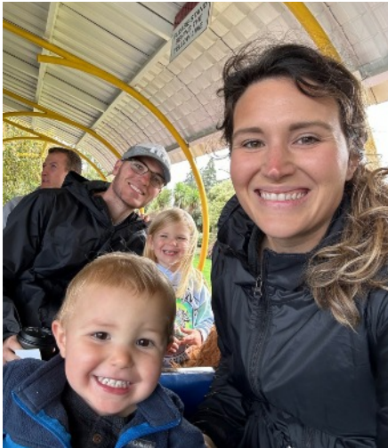
Riding an outdoor train during a long weekend in Taupo, New Zealand.